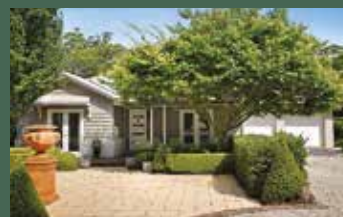
SOLD - Bowral