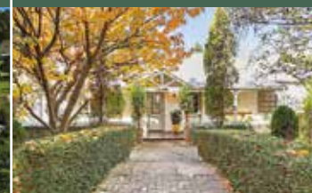
SOLD - Bowral