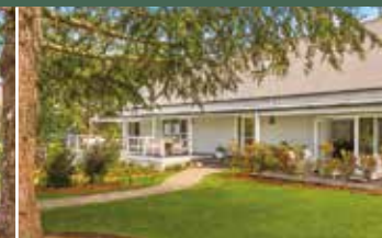
SOLD - Kangaroo Valley