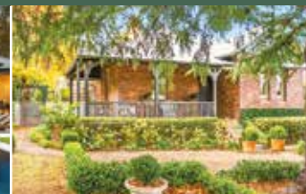
SOLD - Bowral