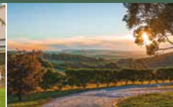
SOLD - Marulan