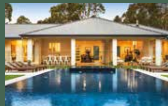
SOLD - Kangaroo Valley