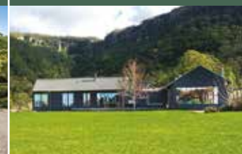
SOLD - Barrengarry